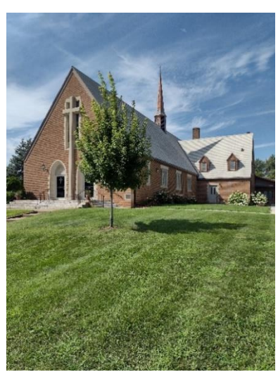
Zion Lutheran Church 264 East Main St., Mondovi, WI 54755

You are most welcome to Worship Sundays - 9:00 a.m. Wednesdays - 11 am & 7:00 p.m. Christmas Eve - 4:00 p.m. & 7:00 p.m. Christmas Day - 10:00 a.m. New Years Eve - 7:00 p.m.