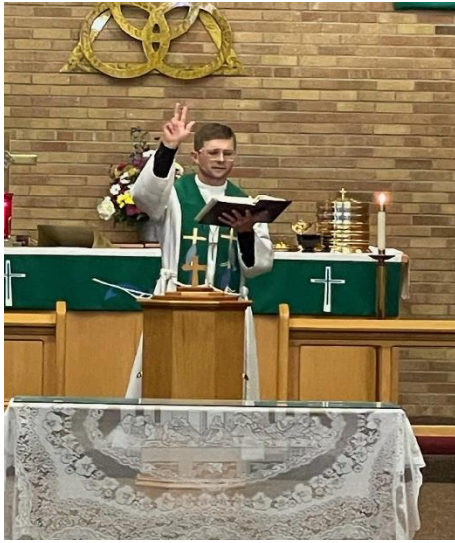
Left: Pastor giving God's blessing to the congregation, one last time June 9, 2024

During his final Wednesday evening service on June 5, 2024, Mondovi was hit with a thunderstorm. Zion creaked and cracked, then the power went out. The Service continued with the light from the Altar Candles. Communion was given by light of the Communion candles. This was a beautiful(symbolic to many) service. A grand exit service given by God. Upon walking outside we were